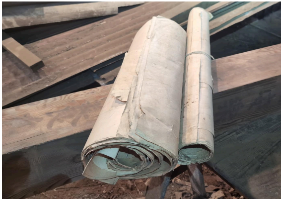
Sewing patterns found

seamstress or if the patterns were made for her, please reach out to us!